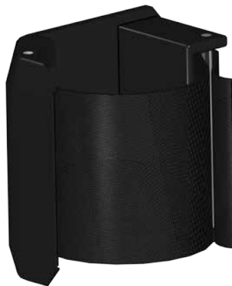
Mount Clamp Qty (2)

Read instructions and view illustrations before beginning.